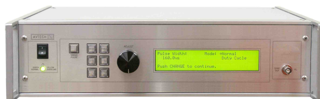
AV-109E-1-B Front Panel (Output connectors are on rear panel)

Some aspects of these instruments are readily adaptable for special applications. For instance, maximum duty cycles can be extended if the maximum load voltage rating is reduced. Contact Avtech ( info@avtechpulse.com ) with your special requirement!