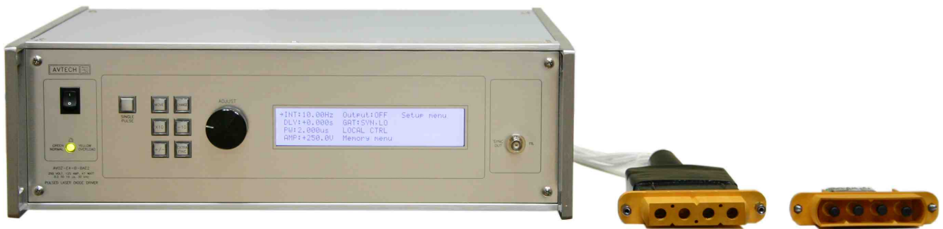
Pulser mainframe (left) with AV-HLZ1-100 output cable (middle) and mating adapter (right)