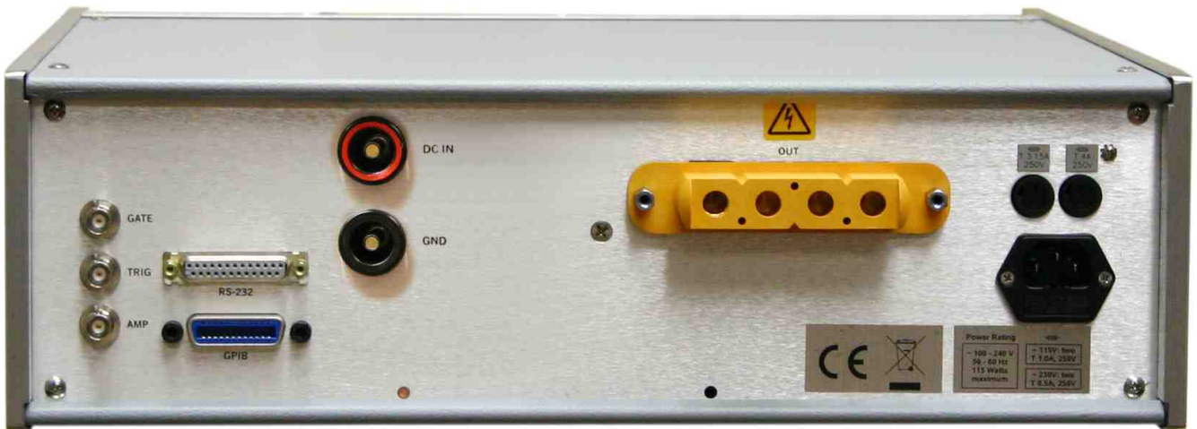
Mainframe Rear Panel